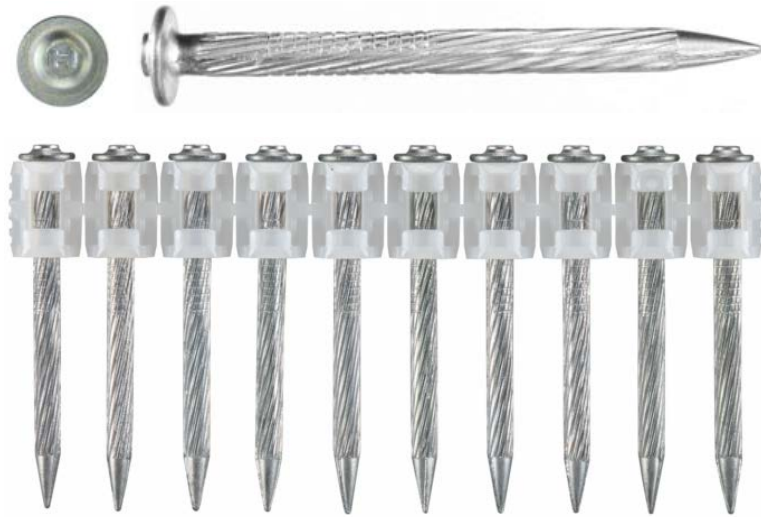
FIGURE 1—HILTI X-GPN 37 MX, X-PN 37 G2 MX OR X-PN 37 G3 MX FASTENERS